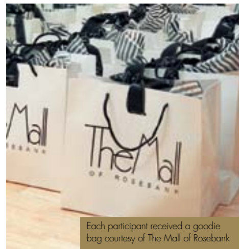
Each participant received a goodie bag courtesy of The Mall of Rosebank