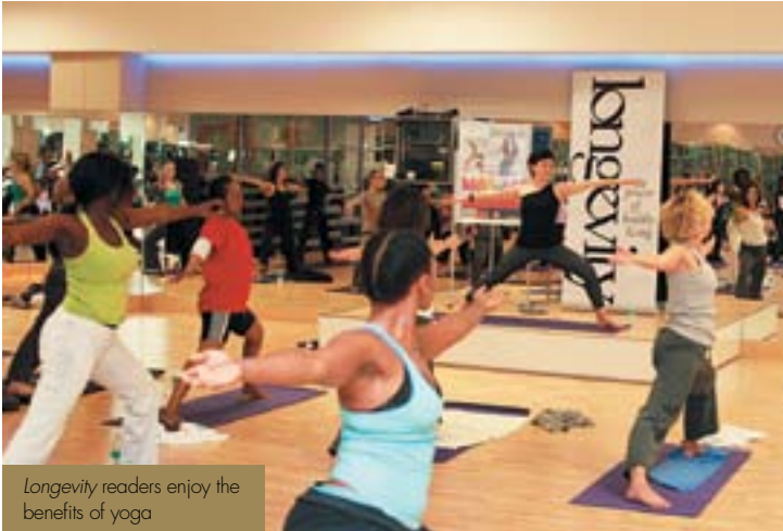
Longevity readers enjoy the benefits of yoga